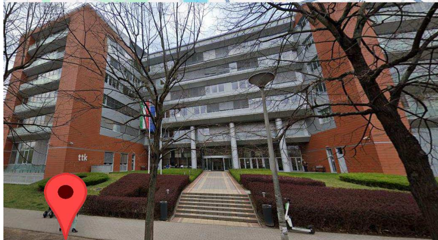
Research Centre for Natural Sciences 1117 Budapest, Magyar tudósok körútja 2.