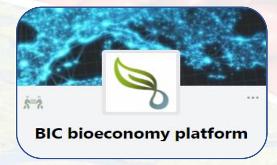
Connect with regions