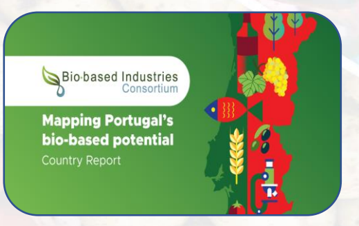
Expand the bioeconomy in EU Member States