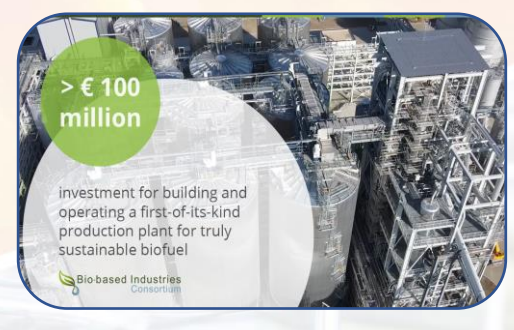
Highlight the importance of bioeconomy investment for growth and jobs