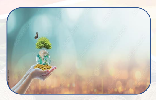
Formulate the Strategic Research & Innovation Agenda (SRIA) with the EC