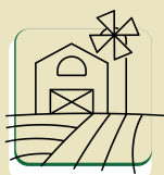
Theme 1: Resilient small and medium-sized farms

The BIOEAST OIC is organised under 8 themes, each of them describing a problem statement, key issues to be addressed, and a non-exhaustive list of solutions the call is looking for. The BIOEAST OIC themes are: