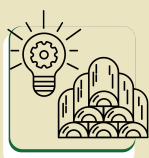
Theme 5: Innovative wood technologies