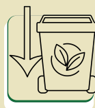
Theme 3: Biowaste reduction and valorisation