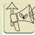
Theme 8: Raising awareness of the circular bioeconomy