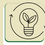
Theme 4: Sustainable bioenergy