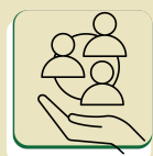
Theme 7: Strengthening stakeholders' engagement and collaboration to drive innovation